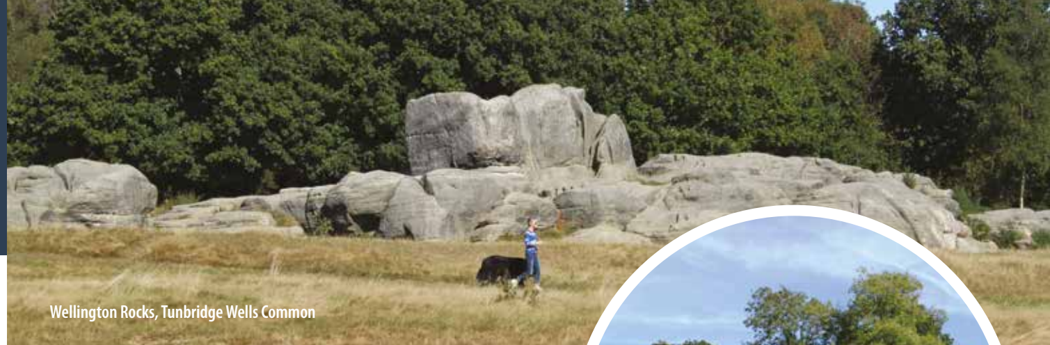
Wellington Rocks, Tunbridge Wells Common