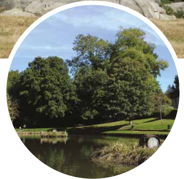
Holden Pond, Southborough

SPELDHURST is the oldest parish in the area, dating back to the 13th century. The