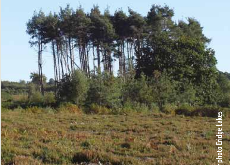
Cover photo Eridge Lakes

Kent HIGH WEALD protect / explore / enjoy