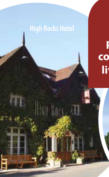
High Rocks Hotel

The unique habitat that the rocks provide support rare communities of mosses, liverworts and lichens.